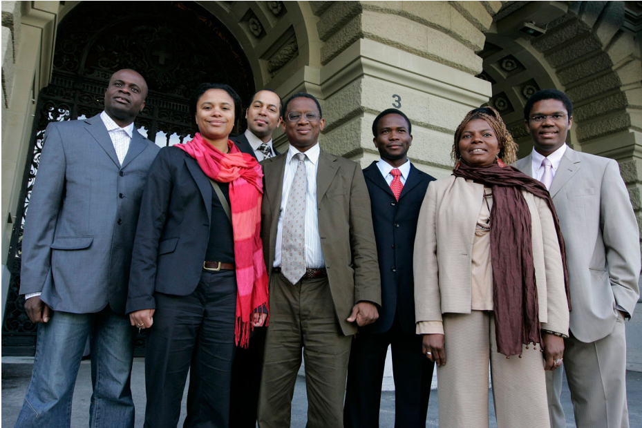
Figure 2. The candidates of ‘African descent’ pose in front of the Swiss National Assembly

The candidates sought to expose and displace the poster’s racist violence. They juxtaposed the childish and cartoonish address of the poster with the gravitas of solemnly posed bodies signifying ‘humans of flesh and blood’. By mobilizing the body as a medium, ‘as a means of self-expression and as a carrier of a message to spectators’, 35 they disrupted the euphemizing logics of the cartoon graphics and the black/white chromatism. They invited viewers to read the black sheep as the signifier of bodily markers categorized by racialized difference. Their visual performance echoed numerous other interventions that verbally associated the black sheep with a specific position of racial difference. Further, the performance shed light on a national context already heavily marked by racism. For instance, one candidate declared that the ‘poster stigmatises one race, one colour’, while another claimed that her childhood in Switzerland was ‘harder than for others since she was black’. 36