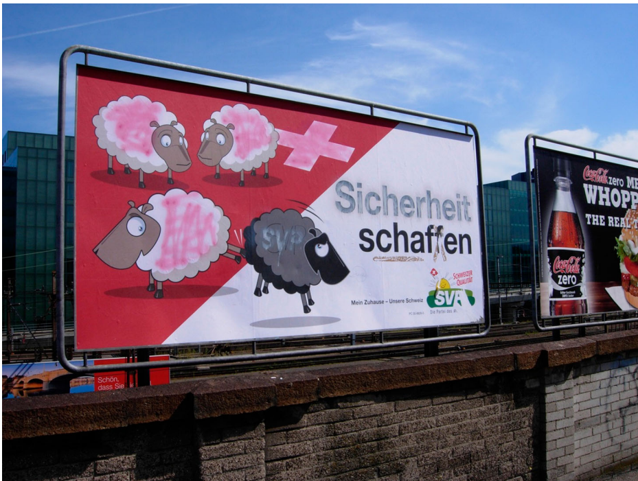
Figure 1. Street view of the Swiss People's Party (SVP) 'sheep' campaign of 2007

pitted demands for the ban or official condemnation of the campaign due to its racism or exclusionary content against discourses of support affirming that the poster had 'nothing to do with race'. Drawing on the analysis of a corpus of public claims expressed by various actors against or in defence of the poster during the controversy, I show that the sheep poster controversy consisted of a struggle between three antagonistic articulations of 'Swissness' and 'difference': an anti-racist discourse, an anti-exclusionary discourse, and a defensive discourse. I furthermore demonstrate that this struggle reasserted and renewed a regime of raceless racism.